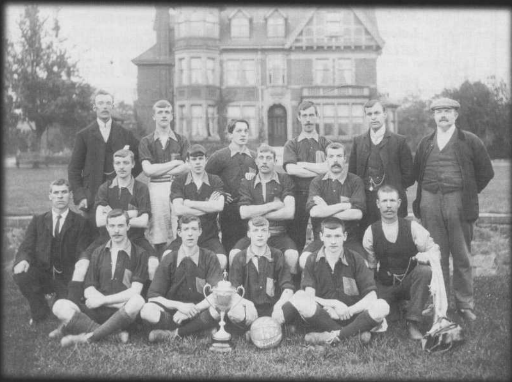
SILEBY VICTORIA F.C., 1904-5