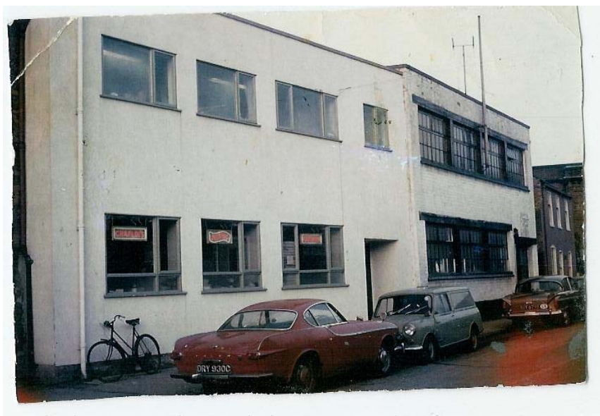
Chaplins Factory photographed in approximately 1965