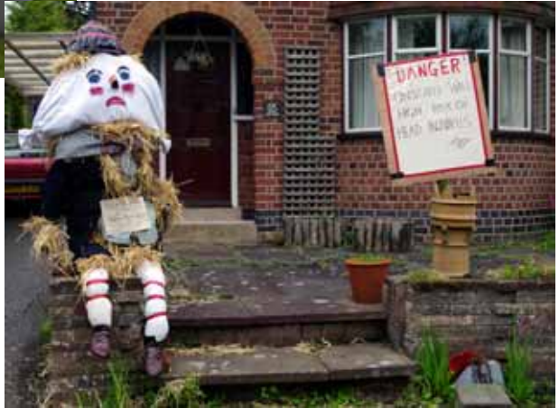
Humpty Dumpty, second place Adult