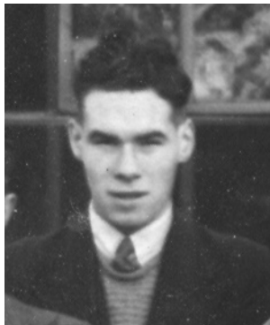
Not certain this is him?